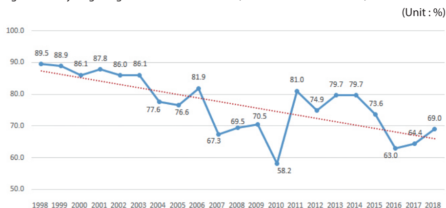
Figure 1. Yearly Wage Negotiation Settlement Rate (as of the end of November)

Note : Establishments with 100 or more Regular Employees.